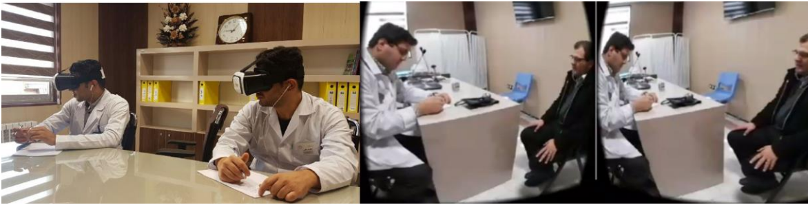
Figure 4. The students are taking the virtual reality based OSCE for clinical skills of internal medicine based on a simulated consultation between physicians and patients