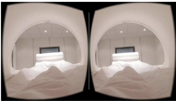
Figure 5. The production of medical electronic contents by virtual reality technology (MRI simulator)