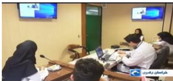
Figure 1. E-clinic, an internal specialist with medical students receives the visual information and guides the family physician in rural health center